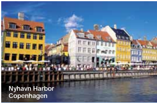
Nyhavn Harbor Copenhagen