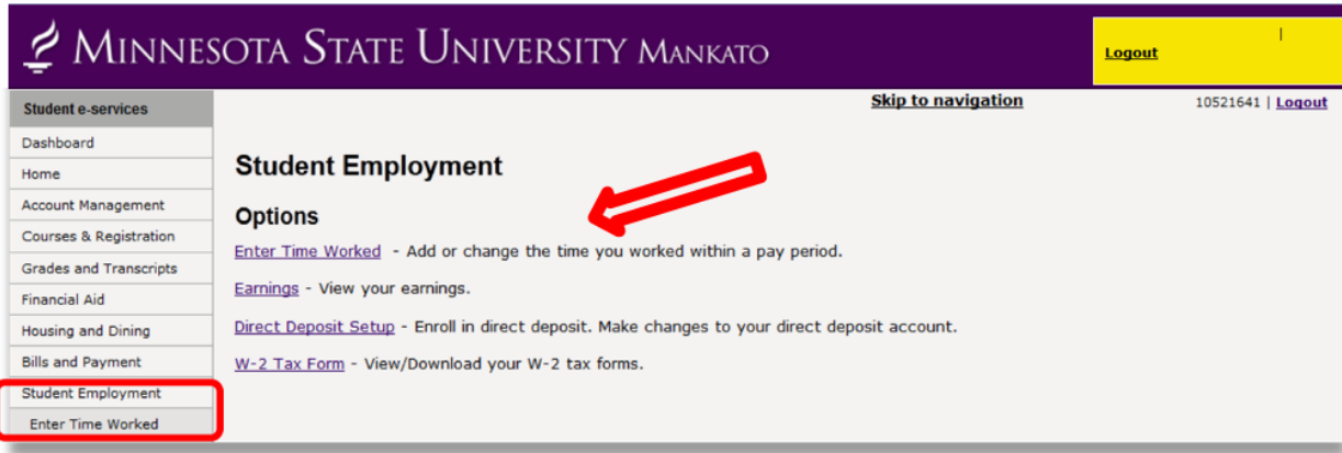
Figure 1 MnSCU eservices Student Employment screen. Enter Time Worked option