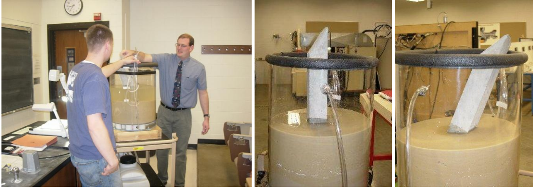
Figure 2. Liquefaction Tank for teaching Geotechnical Engineering concepts

Additionally, such active learning techniques as Think-Pair-Share groups, boardwork by the individual students, and student presentations were all incorporated in the CIVE 360 course (see Figure 3). Such application of active learning has been helpful in increasing the comprehension of the students, as well as amplifying their enthusiasm for learning. Through this process I have challenged myself to develop additional active learning applications in these and other courses, such that my overall teaching effectiveness can improve and the education that the students achieve can expand.