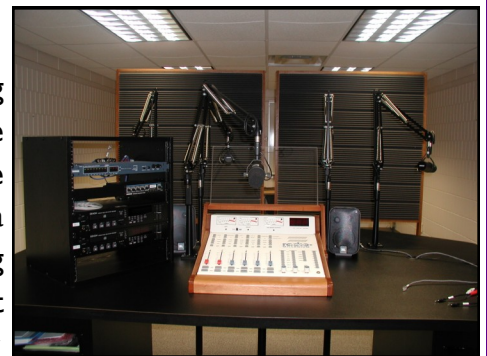
New Studio in Austin, MN

As I have mentioned in previous newsletters, we are moving forward with the KMSK studio in Austin, MN. A recent image is featured here. I expect the studio will be operational by the time you receive this newsletter, although we will be doing a "soft open," working the bugs out of the system before having a much anticipated celebration in Austin, MN. We look for that opportunity sometime this summer. Many thanks to our partner institution, Riverland Community College. Riverland Community College is a member of the Minnesota State College and University System, as is Minnesota State University. This common bond was instrumental in making this relationship possible. If you haven't been following this new initiative, feel free to read the account in the