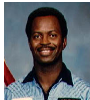
Ronald Erwin McNair, Ph.D. (October 21, 1950 – January 28, 1986) was one of the astronauts killed during the launch of the Space Shuttle Challenger , mission STS-51-L . He was a native of Lake City, South Carolina .