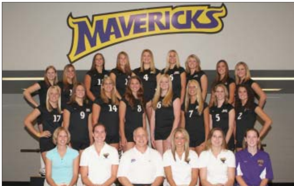
2005 Minnesota State University Volleyball