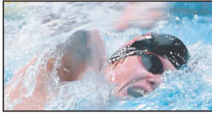
PREP SWIMMING, PAGE C5

Sunday, January 25, 2009 www.mankatofreepress.com