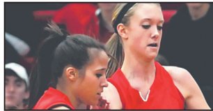
GIRLS BASKETBALL, PAGE D2