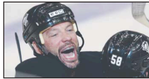
NHL, PAGE D3