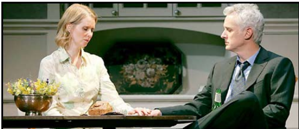
Cynthia Nixon as Becca and John Slattery as Howie, grieving parents from the Manhattan Theater Club's production of Rabbit Hole .

Becca and Howie Corbett have everything a family could want, until a life-shattering accident turns their world upside down and leaves the couple drifting perilously apart. Rabbit Hole charts their bittersweet search for comfort in the darkest of places and for a path that will lead them back into the light of day.