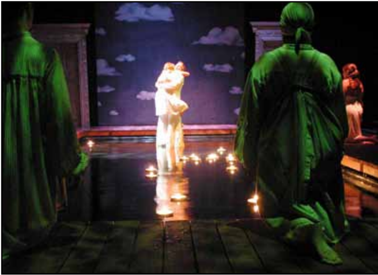
A scene from the 2004 production of Metamorphoses , staged in the Andreas Theatre with a large pool at its center.