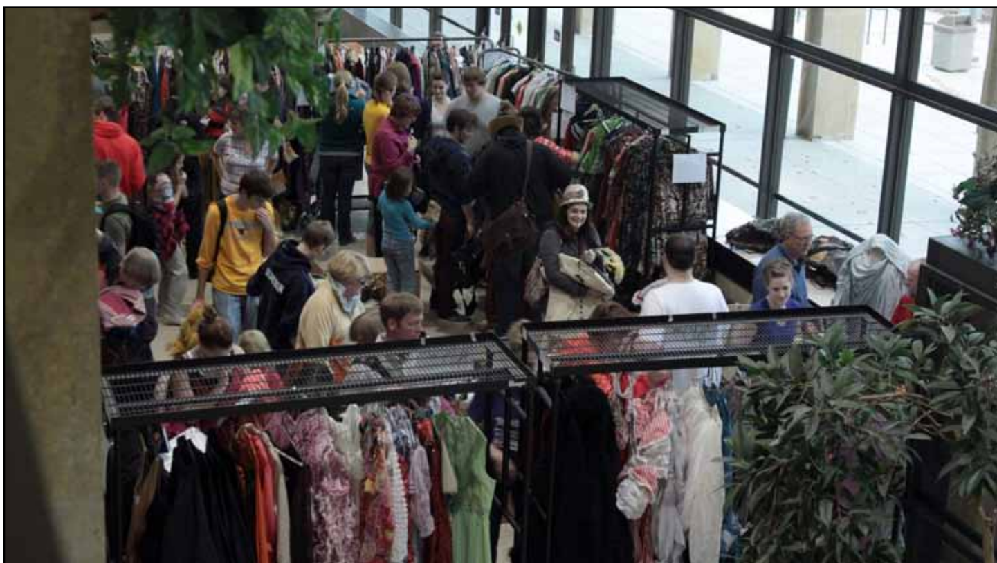
The Performing Arts Center lobby filled up quickly when costumes went on sale Oct. 25 and 26.