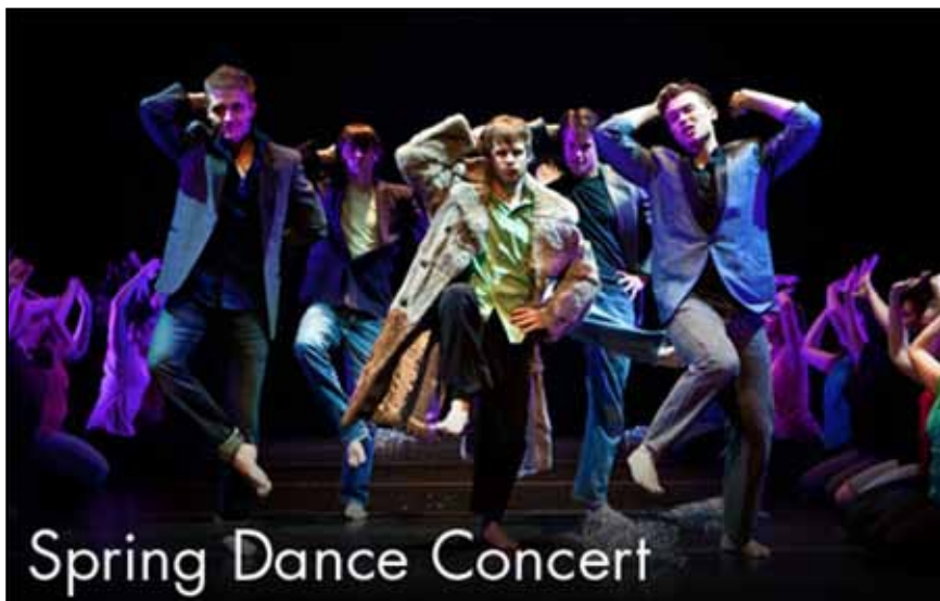
In order to give them more prominence, we've split off a Dance area web site from the Department of Theatre & Dance page. You can access it from MSUTheatre.com , or find it directly by simply typing in MSUDance.com