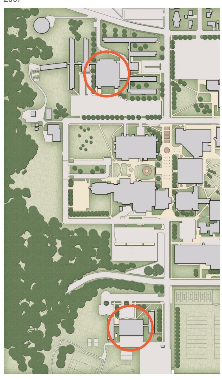
Up to 2,891 students were served in 41,687 GSF of residential dining space.