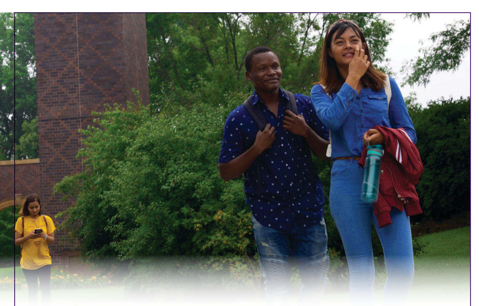
Objective 4.3: Enhance the quality and coherence of the Kearney Center and communication on social media, university website, and print to better tell our story and recruit & retain more students.