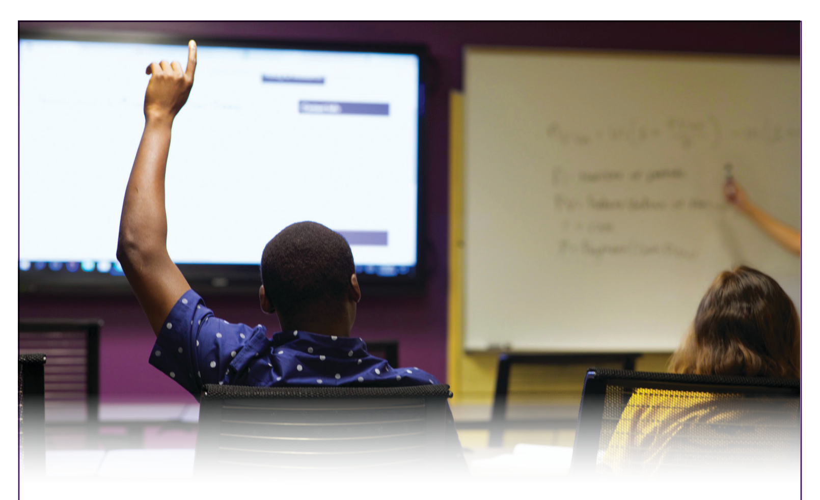
Objective 5.3: Identify opportunities to leverage and recognize faculty engagement and leadership, and expertise within Global Education in advancing internationalization of the campus and community.