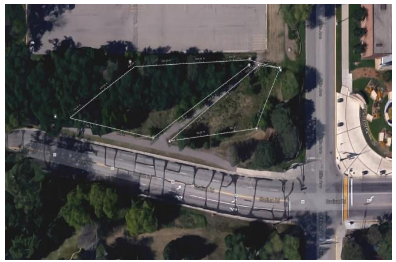
West Area Total parameter distance: 382 ft East Area Total parameter distance: 630 ft