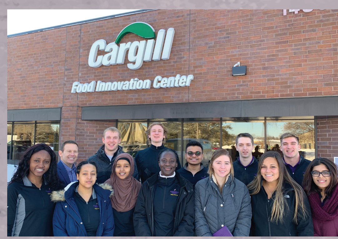
Students gather outside Cargill in February 2020.

Read more about this story in the 2020 edition of InReview Magazine.